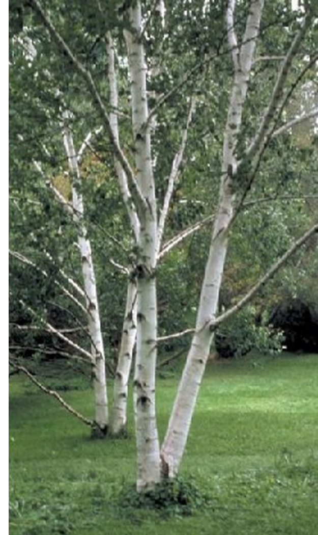
Paper Birch (Betula Papyrifera)